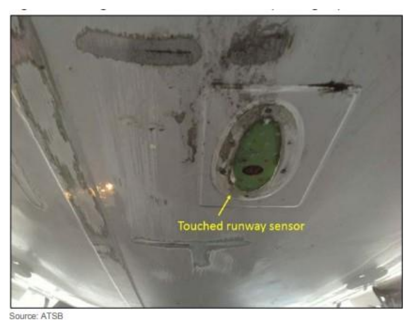
Figure 2 - Damage to tail section VH-QOS (looking aft)

The two occurrences had numerous commonalities, including: